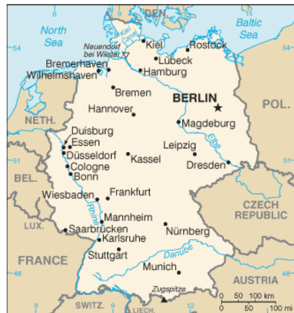
Federal Republic of Germany