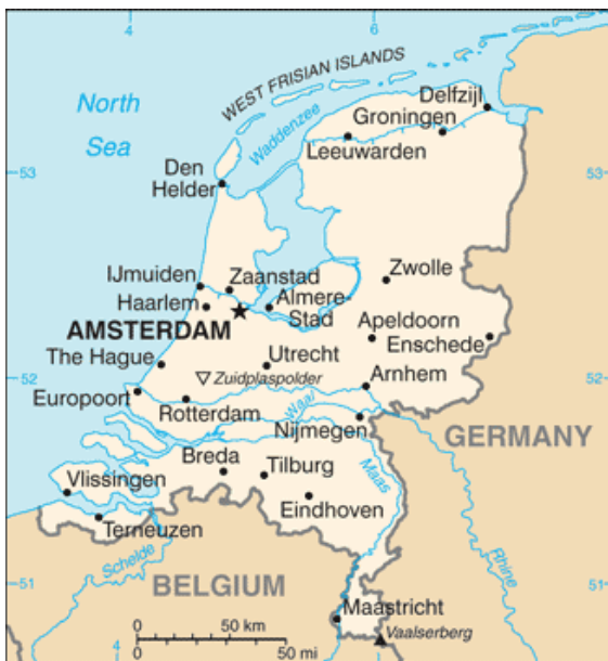
Kingdom of the Netherlands